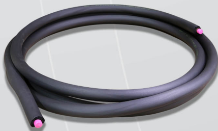
Type "H" Piece Insulated Copper Tube (Single Line)