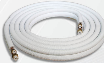
Type "B" Set Mini-Split Twin Tube (Joined)