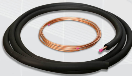
Type "F" Set Standard Plain End Line